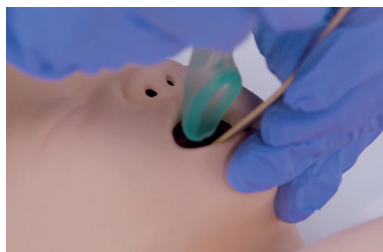
Advanced Airway Management*