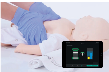
Precise QCPR Feedback

Resusci Baby QCPR offers a new level of precision training for infant CPR skills and high-performance team training, enabling professional first responders to gain the confidence they need to act quickly during the high-stress experience of responding to an infant cardiac arrest.